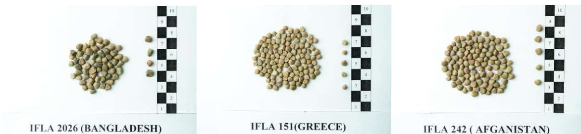
Fig. 1: IFLA 2026 (Bangladesh), IFLA 151 (Greece) and IFLA 242 (Afghanistan) samples