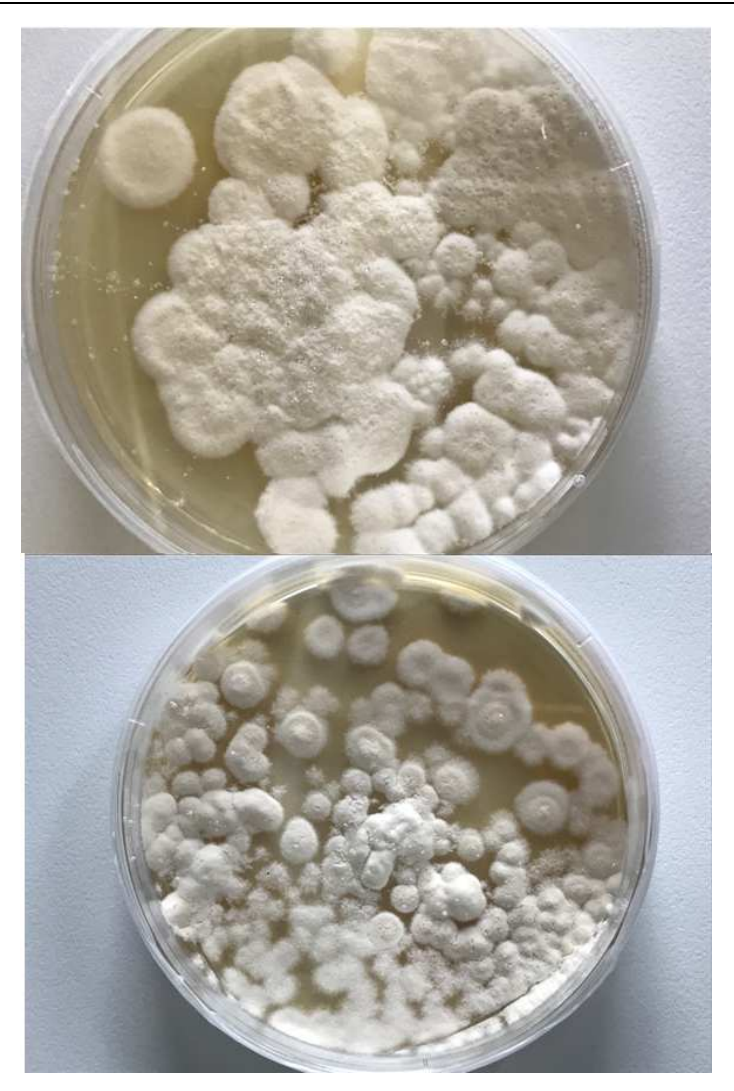
Fig. 2: Entomopathogenic fungi were isolated from bark beetles