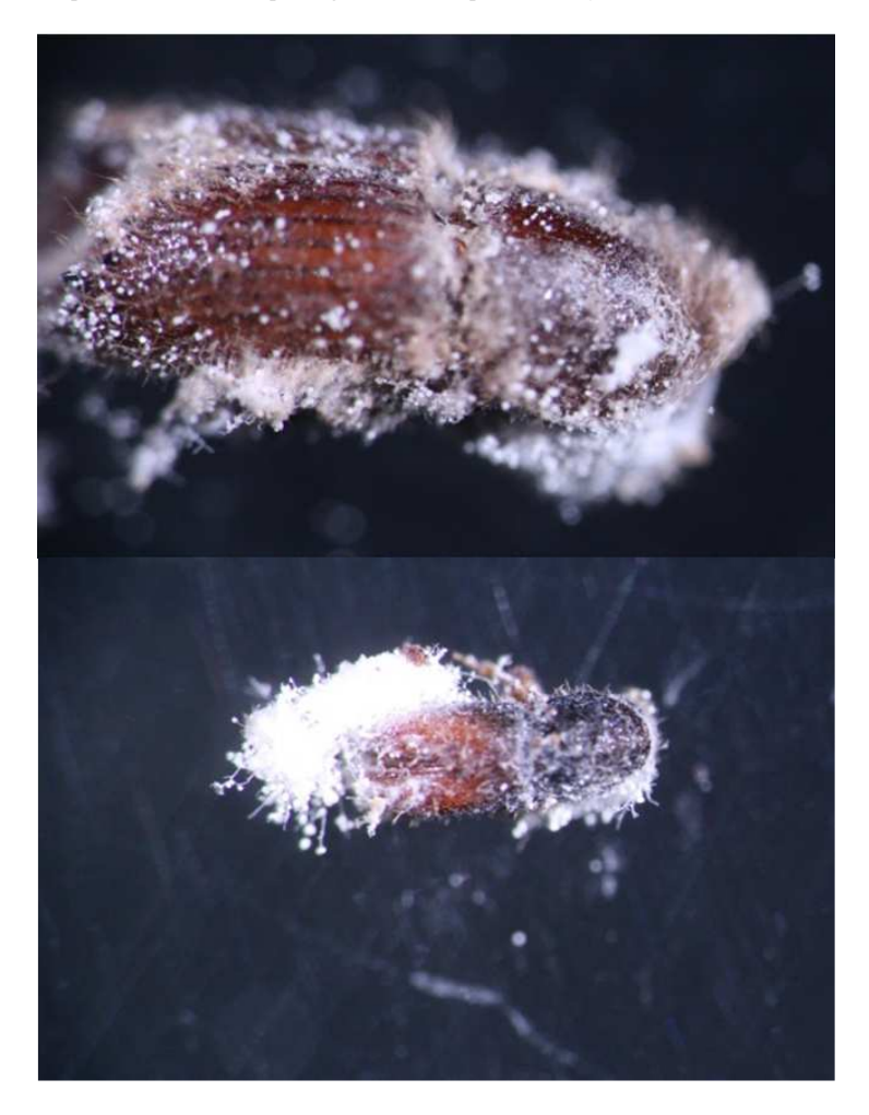
Fig. 4: Mycosis on adult bark beetles caused by isolate of B. bassiana

Fig. 3: Structure of species composition of entomopathogenic anamorphic ascomycetes isolated from adults dead bark beetles