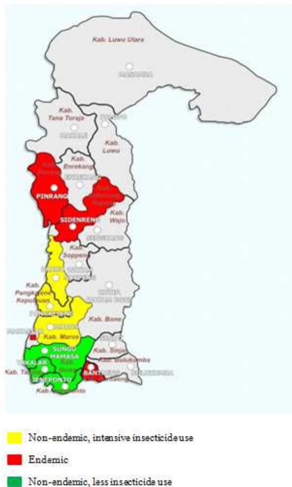
Fig. 1. Survey locations for the abundance and species composition of Nephrotettix spp.

In each district, 3 to 4 samples of 20 sweeps each were collected using a 37-cm net hoop with 1.2 m wooden handle. Rainfall patterns are different between the RTV-endemic and non-RTV-endemic areas. In non-RTV-endemic area the rainy season occurs from October to May; whereas in RTV-endemic area, the rainy season occurs from April to July in Sidenreng Rappang and Bantaeng and November to July in Pinrang (Climatology Station, Maros 2013). The samples were collected from the farmers' rice fields, 5-15 km apart. Sampled fields were situated along the provincial main road, about 100-200 m off the road to avoid the road effects. Leafhoppers collected from each location were placed into a 1-l plastic jar containing a small chloroform-saturated cotton ball to knock the leafhoppers down. The leafhoppers were then brought back to our laboratory for identification, sorting and counting. Because the age and cultivar of rice plant affect the leafhopper population level (Widiarta et al. , 1997), 2-3 weeks old rice cv. Ciherang (the most commonly planted cultivar in the study sites) was chosen for the sampling in all study locations. Leafhopper samples were collected until the onset of panicles.