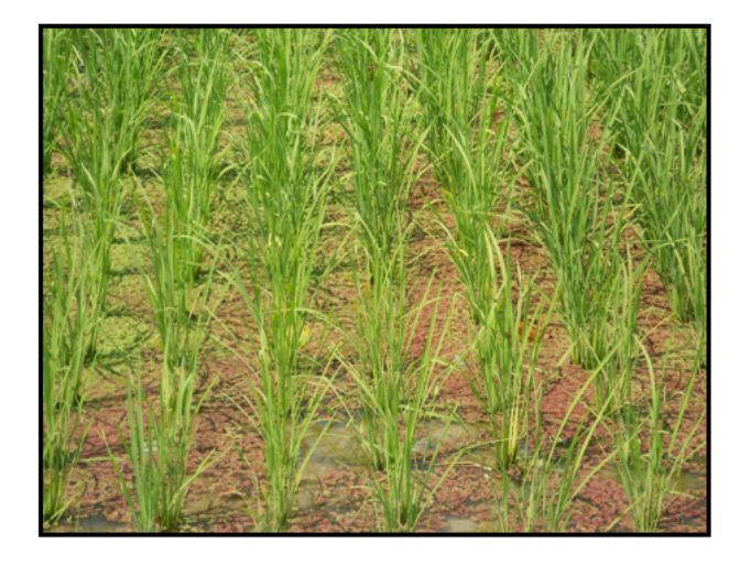
Fig. 2. Organic agriculture based traditional rice cultivation using Azolla as a bio-fertilizer

The utilization of BGA as a bio-fertilizer for rice is very promising, so also referred as 'paddy organisms'. N is the key input required in large quantities for low land rice production. Soil N and BNF by associated organisms are major sources of N for low land rice. The 50-60% N requirement is met through the combination of mineralization of soil organic N and BNF by free living and rice plant associated bacteria (Roger and Ladha, 1992). To achieve food security through sustainable agriculture, the requirement for fixed nitrogen must be increasingly met by BNF rather than by industrial nitrogen fixation. Most N fixing BGA are filamentous, consisting of chain of vegetative cells including specialized cells called heterocyst which function as micro nodule for synthesis and N fixing machinery. BGA forms symbiotic association capable of fixing nitrogen with fungi, liverworts, ferns and flowering plants, but the most common symbiotic association has been found between a free floating aquatic fern, the Azolla and Anabaena Azollae (BGA) (Mahdi et al., 2010). BGA have contributed greatly to the enrichment maintenance of soil fertility in rice fields. On farm level, the algae can contribute to about 25-30 kg N/ha. Recent researches have shown that algae also help to reduce soil alkalinity and this opens up possibilities for bio-reclamation of such inhabitable environment.