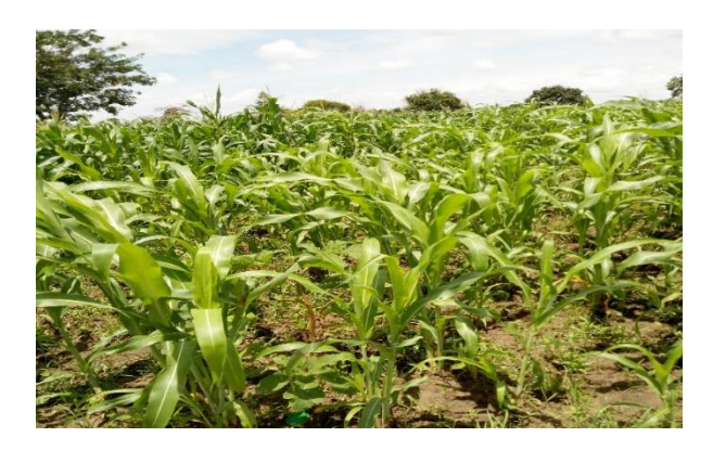
Fig. 2: Maize farm at Nafkoliga