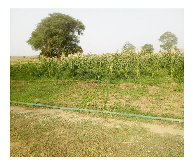
Fig. 4: Farmer drawing water from the white volta river using a host