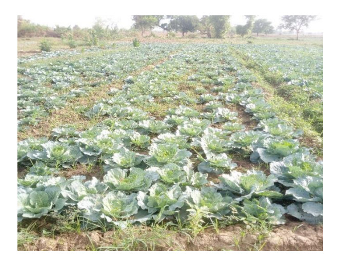
Fig. 3: Cabbage farm in Kubore