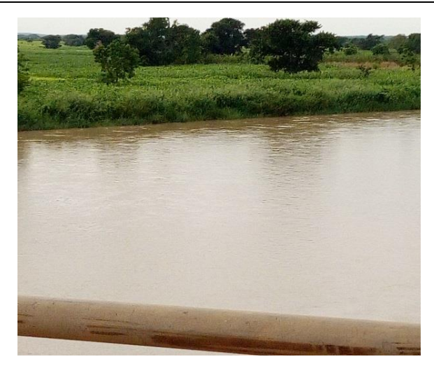
Fig. 5: Crops planted along the a

Again, dug-outs were another source of water for irrigational activities in some communities because they could be found in almost every community, especially during the dry season. Though they came in their numbers, most of the dug-outs were dried up, forcing farmers to dig at any space at their farms with the hope of getting water for their crops. However, these dug-outs were not common in the study communities since they were located along the White Volta River. The farmers, therefore, depend on the river for their farming activities except those who could not afford to buy pumping machines, had these dugouts as their source of water.