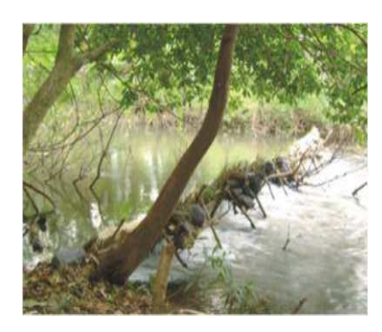
Fig. 2: Wooden weir in Lam Ta Kong River Basin

An applied Local Wisdom: An applying the local wisdom to manage water for developing the economic, society and culture of Lam Ta Kong's community that there were above two characteristics as the first type for storage water and divert to used area and the second type for storage water and distribution water including