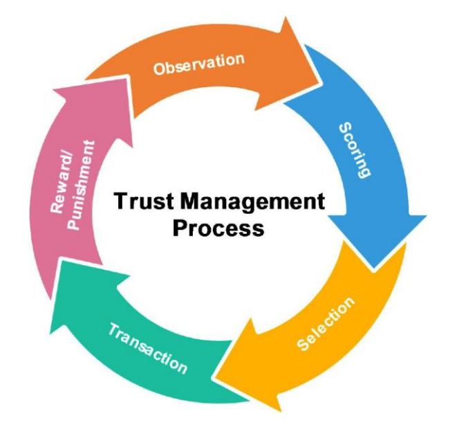
Fig. 3: Life cycle of trust management process

In the proposed scheme, the GCP secures the private data of the hubs and gets the optimal graph clustering impact using BGV homomorphic encryption and structural information theory.