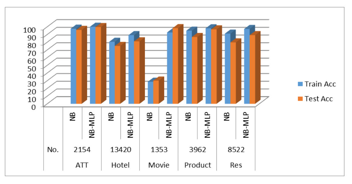
Fig. 2: Train and test accuracy for NB and hybrid NB-MLP

Figure 3 shows result of overall correct samples classification for the five datasets. For movie reviews dataset, NB classifier found 396 correct samples from 1353 reviews. From combing result of NB and MLP, The proposed NB-MLP classifier found 1291 correct samples.