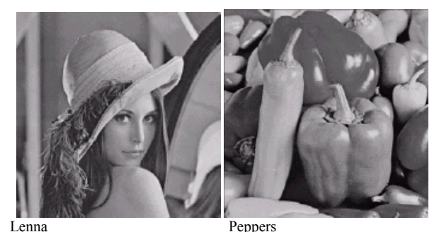
Fig. 3: Real test images