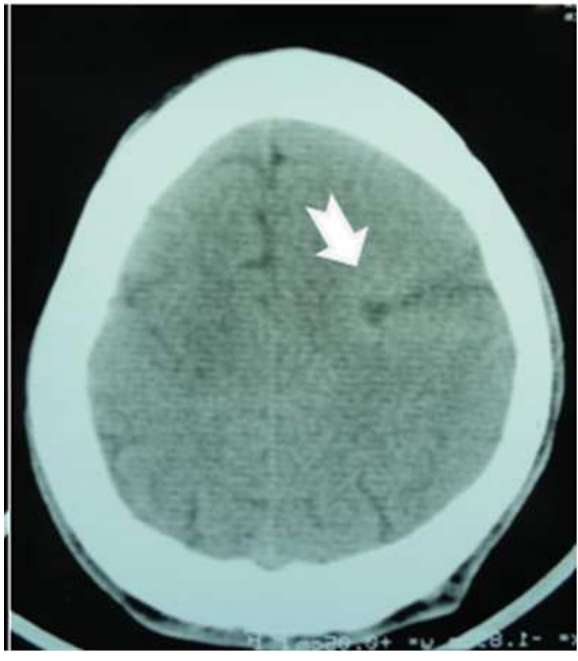
Fig. 1: Imaging studies showed parietal gaps of closed lips, small and on both sides, taken together confirms the schizencephaly diagnosis

The clinical picture presents itself according to the severity of symptoms, depending upon the exact extent of the anatomical defect and also on the location of the brain defect (Amaral et al. , 2001). The most common clinical findings include: motor deficit, epilepsy/seizures and mental retardation associated to delayed neuropsychomotor development (Rodrigues et al. , 2006; Amaral et al. , 2001).