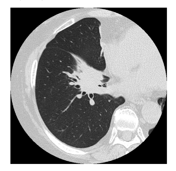
Fig. 2: Chest CT on admission showing a mass shadow (30×35 mm) in the right hilum (headarrow). (Case 5)

The diagnostic methods consisted of culture of local respiratory clinical samples using bronchoscopy in all patients. The time required to obtain a definite diagnosis was from two to six weeks. Regarding the microbiological identification of Nocardia species using 16s rRNA gene sequence analysis, N. farcinica was most frequently found in three patients, N. puris in one and N. elegans in one, respectively. Other causative microorganisms such as Mycobacterium, fungus species or common bacteria were not detected respiratory specimens from the lesions using bronchoscopy in any patients. No patients had contracted TMP/SMZ-resistant Nocardia species in this study. The treatment for pulmonary nocardiosis consisted of TMP/SMZ antibiotics in the first protocol. However, two patients required a change of antimicrobial agents (MINO or IPM/CS) because of adverse drug events. Finally, the clinical effect and prognosis were good for all patients.