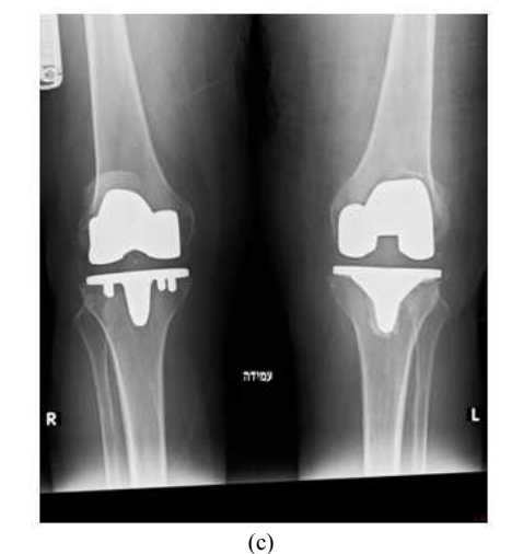
Fig. 1a-c. Post op X-Ray AP and LAT, right cementless LCS, left cemented SIGMA RP