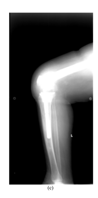
Fig. 7. Status post 2nd stage of left total knee revision with long stem intramedullary rods and metaphysial trabecular metal augments

When the patient arrived to his next meeting we had already the results of Brucella serology taken on his last appointment. The results showed Brucella TIT Ab IgM: 1:320 and Ab IgG: 1:320, a positive rose Bengal test. B.melitensis Ab serology 1:20+, B.abortus Ab serology 1:10++++. CRP: 7 mg L<sup>-1</sup>, WBC: 5.23 K \mu L<sup>-1</sup>. The infectious disease specialists decided upon these values that we managed to confine the disease but we are unable