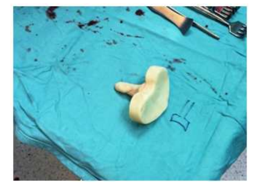
Fig. 4. Tibial spacer with antibiotics

Fig. 3. Intraoperative pictures during stage 2, removal of spacer