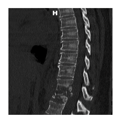
Fig. 1: Preoperative sagittal Computed Tomography (CT) image of the thoracic spine revealing a destructive lesion at T11 and T12 causing a kyphotic deformity with a retropulsed fragment into the spinal canal

Operation: After the patient was intubated uneventfully she underwent an extracavitary approach that has been described by other authors (Snell et al., 2006; Shen et al., 2008; Sciubba et al., 2007), T11-12 corpectomies, drainage of the epidural abscess, placement of expandable cage (Synex®, Synthes, West Chester, PA) and T9-L3 posterior instrumentation and correction of the kyphotic deformity Fig. 4. Intraoperatively, purulent discharge was encountered in the affected vertebral bodies and samples were sent Intraoperative monitoring for culture. using Somatosensory Evoked Potentials (SSEPs) and Motor Evoked Potentials (MEPs) remained at baseline throughout the procedure. Two drains were placed; the muscles and fascia were closed in layers and the skin with staples. There were no intraoperative complications. Her postoperative examination revealed full strength in all her extremities.