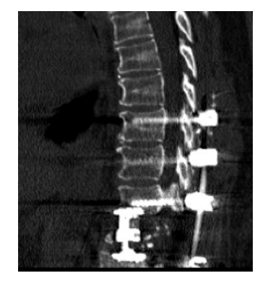
Fig. 4: Postoperative sagittal CT of the thoracic spine demonstrating the position of the construct

Post-operative course: Postoperatively, she was transferred to the neurosurgical Intensive Care Unit (ICU) overnight and was consequently transferred to the regular floor. The infectious disease service was consulted and she was kept on levofloxacin. Postoperatively, her motor strength remained normal in all her extremities and her sensory examinations remained intact to light touch and pinprick. Her pain was well controlled. On postoperative day 4, she was transferred to an acute rehabilitation center to follow a course of physical and occupational therapy in order to gain mobility and ambulatory independence. She also continued on levofloxacin orally (750 mg daily) for an additional 6 weeks post-operatively. Further workup was performed in an effort to reveal any immunologic compromise, infection with HIV and sickle cell anemia or sickle cell trait, which was negative. On follow up visits, she was able to ambulate without any assistance and her back pain had resolved except from some stiffness. Likewise, her infection had resolved and laboratory values had normalized two months postoperatively (WBC was 6,160 mm<sup>-3</sup>, CRP was 0.5 \text{ mg dL}^{-1} and ESR was 30 mm h<sup>-1</sup>).