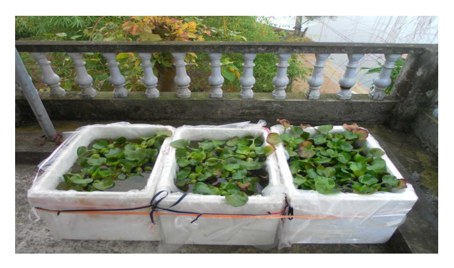
Fig. 3. Water treatment experimental pattern by hyacinths

Figure 3 present the experiment of water treated by hyacinth.