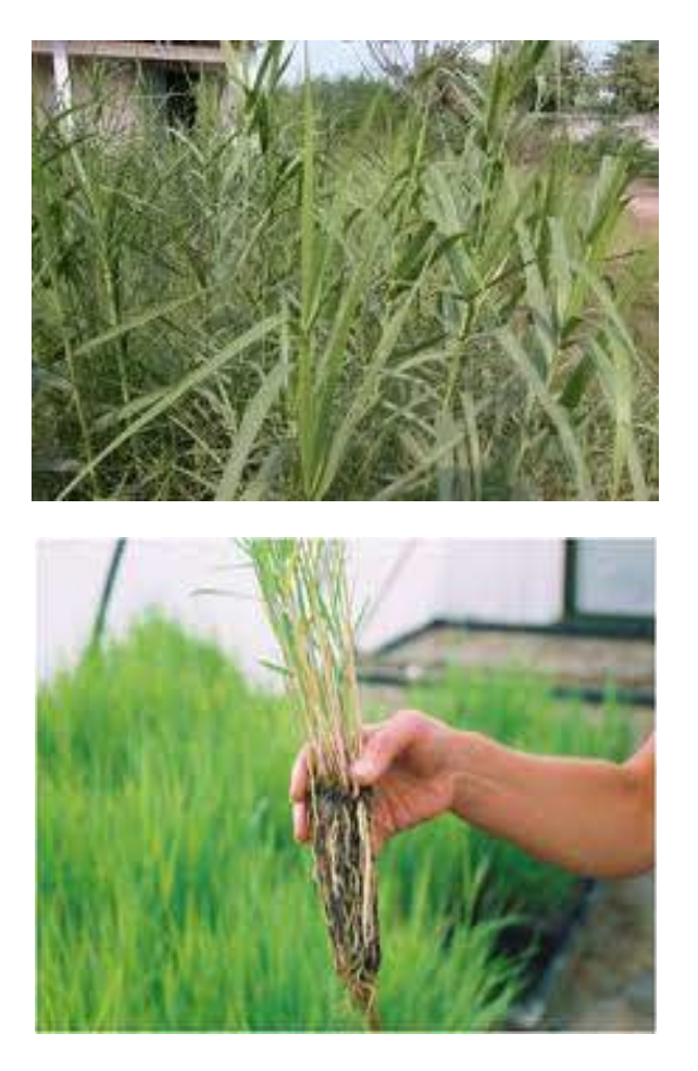
Fig. 5. Reed plants (Phragmites communis)