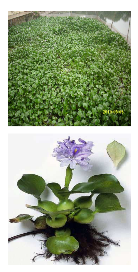
Fig. 4. Hyacinth in a Duong Lake

Therefore reed fields could be used as a biological treatment unit for domestic and industrial waste water. In the 60s of the 20^{\text{th}} century and recent years, Kathe Seidel and many others have applied this method for waste water treatment with the efficiency of 80-90% for NH<sub>4</sub><sup>+</sup>, NO<sub>3</sub><sup>-</sup>, PO<sub>4</sub><sup>3-</sup>, BOD<sub>5</sub>, COD, Coliform (Yem et al. , 2010).