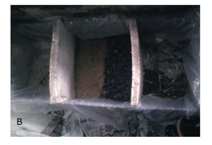
Fig. 2. (A and B): Experimental pattern of horizonetal filter