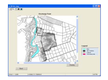
Fig. 3: Water quality monitoring location