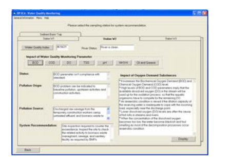
Fig. 1: The result report

system and forward chaining inference mechanism are used to develop the CWQM.