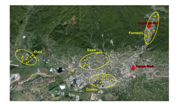
Fig. 1: The satellite image showing the location of the sampling points and the main pollution sources in Baia Mare area

Determination of soil characteristics (pH, electric conductivity and total organic carbon content ): The pH measurement of the aqueous suspension 1:5 (mass/volume) of the <2 mm fraction of the soil samples was performed using a Consort 2000 pH-meter equipped with a combined pH electrode.