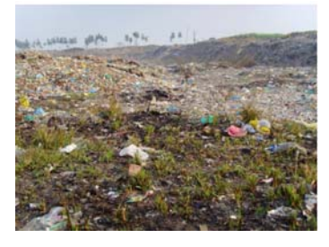
Fig. 2: Photograph of the dumping site at Karnal (Anlauf)

Fig. 1:Locations of the investigated dumping sites in the State of Haryana, India