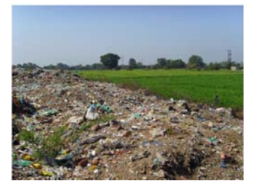
Fig. 3: Photograph of the dumping site at Rohtak (Anlauf)

Fig. 2: Photograph of the dumping site at Karnal (Anlauf)