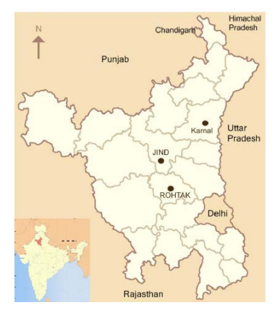
Fig. 1:Locations of the investigated dumping sites in the State of Haryana, India