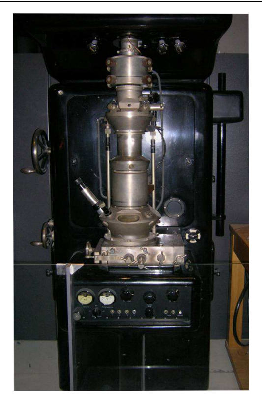
Fig. 2. Electron microscope constructed by Ernst Ruska in 1933; Source: https://en.wikipedia.org/wiki/Ernst_Ruska

Following the theoretical elaborations of Louis de Broglie in 1923, proves in 1926 that magnetic or electrostatic fields can be used as lenses for electron beams. The first electron microscope prototype was built in 1931 by the German engineers Ernst Ruska and Max Knoll. This first instrument maximized the objects four hundred times. Two years later, Ruska constructed an electron microscope that exceeded the possible resolution of an optical microscope. Reinhold Rudenberg, the scientific director of Siemens, patented the electron microscope in 1931, stimulated by an illness in the family, to make visible the polio virus. In 1937, Siemens began to finance Ruska and Bodo von Borries to develop an electron microscope. Siemens also used Helmut Ruska's brother to work on applications, especially with biological specifications.