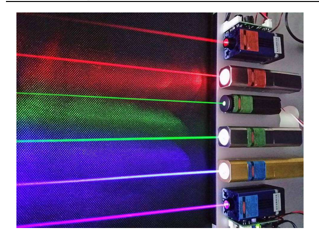
Fig. 4. Red laser (660 and 635 nm), green (532 and 520 nm) and blue (445 and 405 nm)