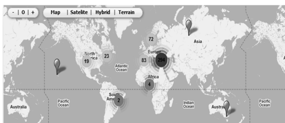
Fig. 6: SportyPal.com displays the latest 500 workouts from world

The Sporty Pal system includes active social network at Sporty Pal.com where users can upload their results. This social network additionally allows users to analyze their results, to compare them with the results of other users, to comment all results and to organize virtual competitions.