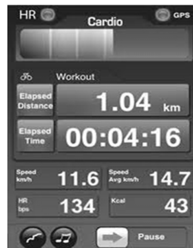
Fig. 5: Application Sporty Pal displays details (current values of the parameters) about current users' exercise

Sporty Pal system is capable of reading parameters for a particular activity, such as path length, speed, time interval, consumed calories. With the help of the GPS service on the mobile phone, Sporty Pal application reads and writes a map of the path by which the activity is executed (Fig. 5). By using an additional device that connects with the application, it can read health parameters of the user, (currently heart rate). Each execution of a specific operation is stored as a separate workout. The user has access to all of his stored workouts and thus he is able to analyze and compare them later. Sporty Pal offers possibility to present each exercise in a map view, draw graphics charts and present its summary information (Fig. 6).