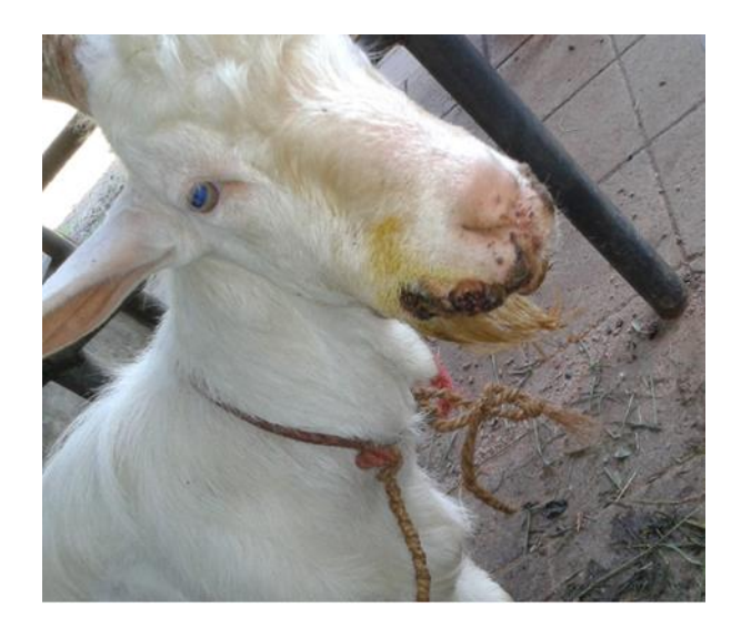
Plate 2: Scabs due to contagious pustular dermatitis

The phylogenetic trees from both maximum likelihood (Fig. 1.) and neighbor-joining methods were the same. In the phylogenetic trees, there are two main clusters. In cluster I there are 35 foreign isolates and ten isolates from Sri Lanka. In cluster II there are three foreign isolates. In cluster I there are six sub-clusters and the local isolates fall in separate sub-clusters. All these isolates fall into three sub-clusters. Four isolates from Anuradhapura, Mannar, Jaffna, and Kilinochchi are closely related and fall into a sub-cluster. Isolates from Vavuniya and Tricomalee fall into a sub-cluster but isolates from Kandy