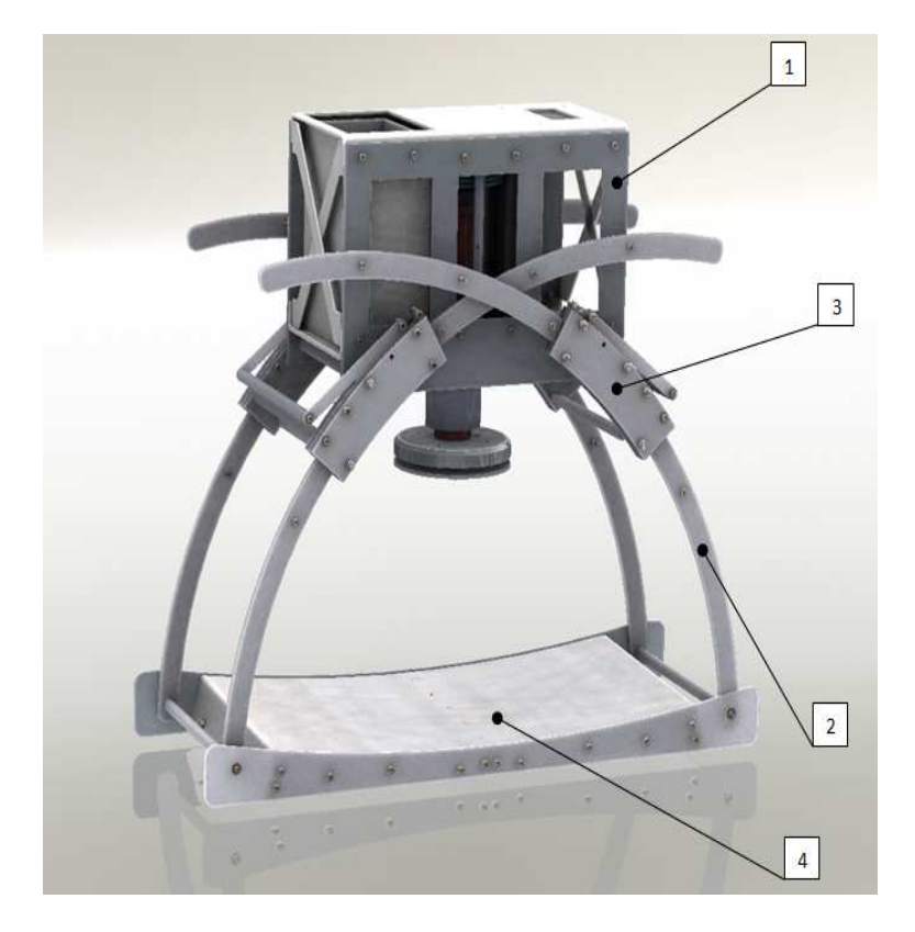
Fig. 1. General appearance of external cardiac compressor: mechatronic drive (1), rod attachment (2), position control mechanism for the actuator depending on the size of the patient's thorax (3), dorsal plate (bottom) (4)

The developed ECC is presented on Fig. 1.