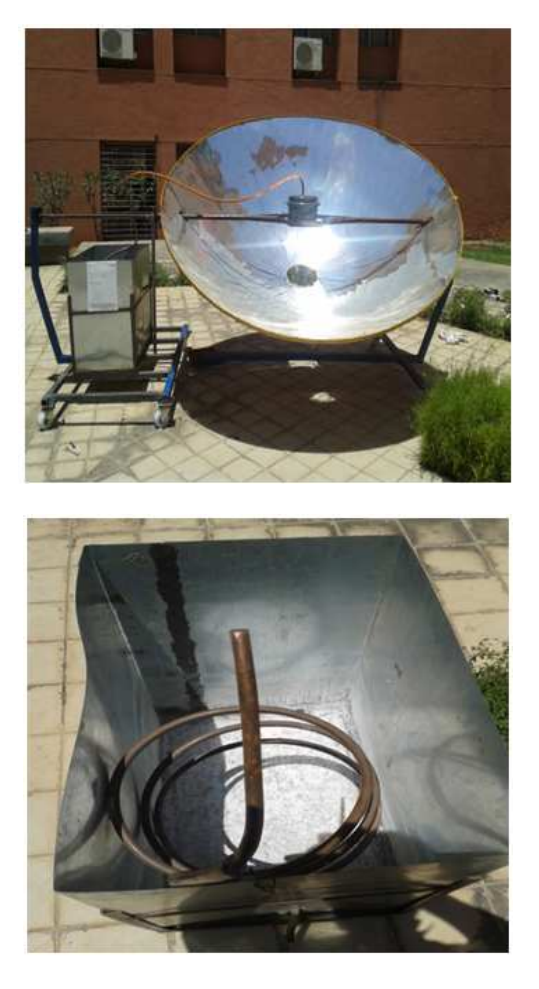
Fig. 1. Experimental Set Up

Eight liters of salt water kept in a black coated cooker gets heated from the concentrator at around 780 watts and steam formation takes place after 40 min. One end of the flexible tube is attached to the outlet of the cooker. The steam from the cooker is passed through the copper tube via flexible tube.