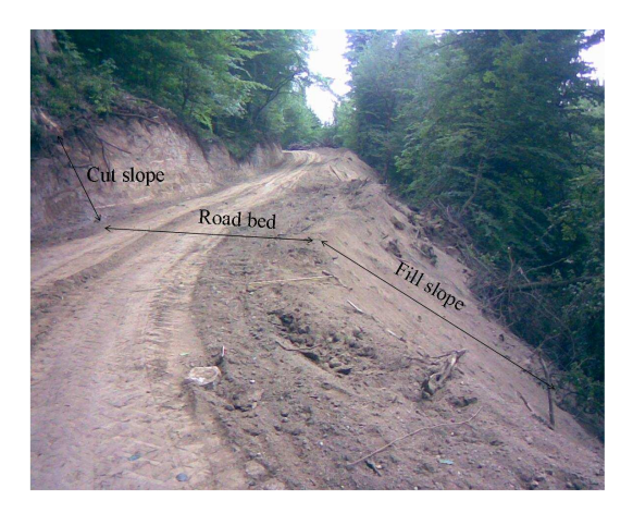
Fig. 1: Components of the forest road cross section

section components. A better understanding of the effects of hillside gradient on forest road cross sections, product recovery and financial return will help improve forest road construction practices based on management goals.