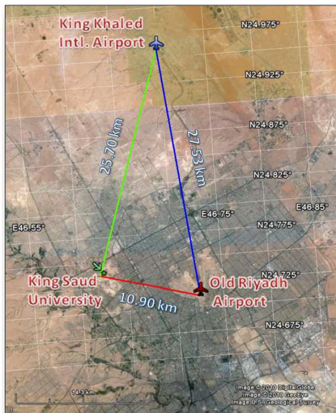
Fig. 1: Location and distances between the study locations

Reference Field data was obtained from Al-Amoud et al. (2010) based on five years project of ET evaluation through lysimeters in 9 zones throughout the country.