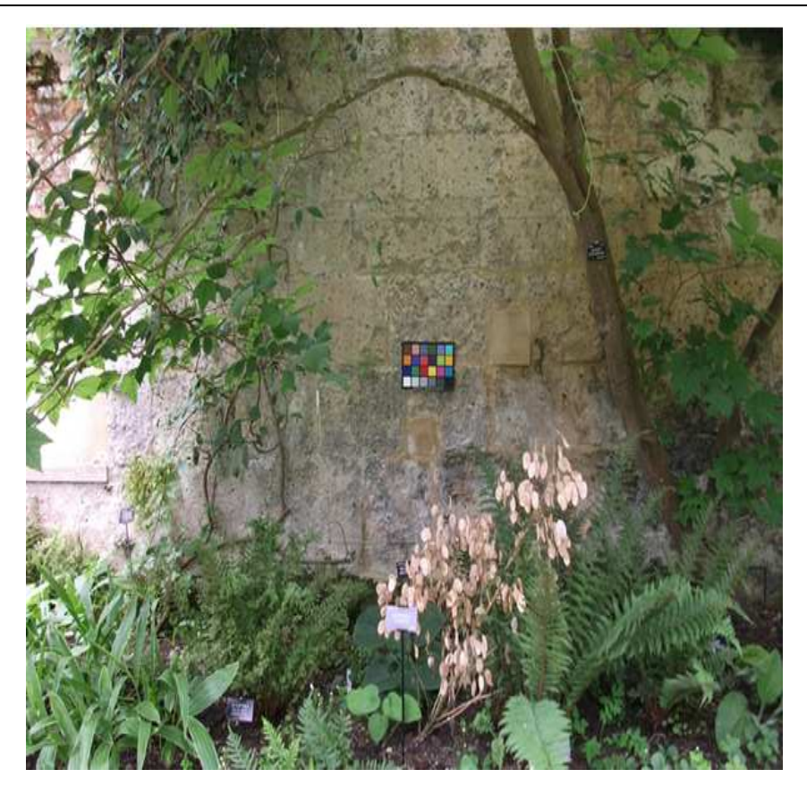
Fig. 2. Encrustation visible at Site 2 (west-facing), where average RMS roughness was relatively high

It is noteworthy that encrustation evident at some sites (Site 2, appearing in Fig. 2) could enhance surface roughness. Also, pitting could augment depth values and Thornbush (2014c) previously observed that pit depth actually decreased (westwards) along this border wall (see her Fig. Iib). Finally, more sites would have helped to elucidate the strength of the correlation between the different methods.