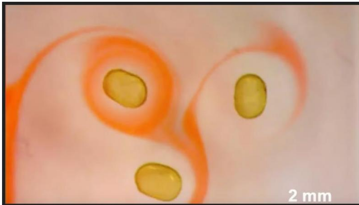
Fig. 1: The first permanently magnetized liquid recently discovered (Berkeley Lab, 18 July 2019)

Russell and his team obtained this liquid magnet by chance while experimenting with a 3D printer. They have tried to print liquids to get new solids but have fluid properties for different energy applications.