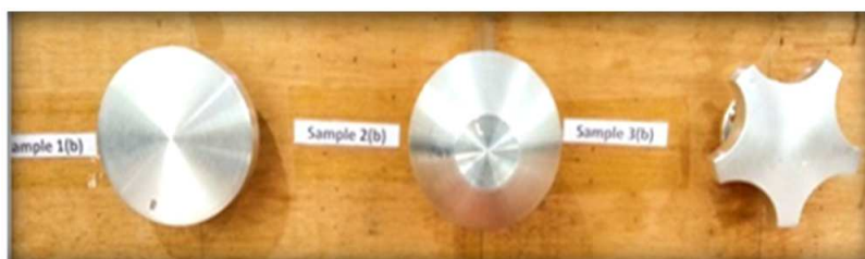
Fig. 1. Large cylindrical, spherical and 5-lobes knobs

In order to simulate the loaded and unloaded condition, 2 different structures were used. The loaded condition borrowed the mechanism of a door knob in order to simulate the loading effect when the screw knobs fitted in the mechanism are turned. The unloaded condition involved internal threads where the screw knobs can just be normally screwed in using their external threads.