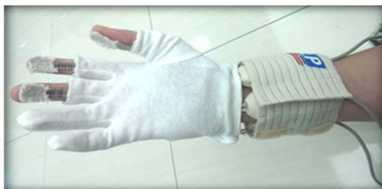
Fig. 2. Complete setup of the sensors