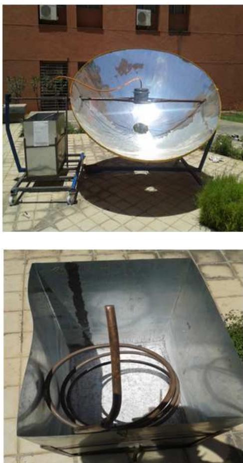
Fig. 1. Experimental Set Up

Eight liters of salt water kept in a black coated cooker gets heated from the concentrator at around 780 watts and steam formation takes place after 40 min. One end of the flexible tube is attached to the outlet of the cooker. The steam from the cooker is passed through the copper tube via flexible tube.