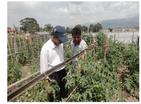
Field observation with senior scientist of NARC