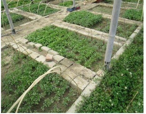
Nursery bed of tomato hybrids