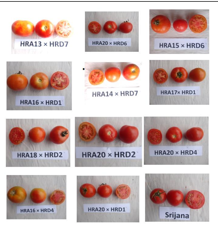
Fig. 3: Hybrids showing morphological fruit characteristics.

Sudip Devkota et al. / American Journal of Agricultural and Biological Sciences 2019, Volume 14: 103.109 DOI: 10.3844/ajabssp.2019.103.109