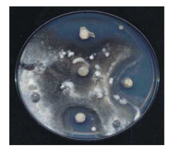
Fig. 1: Bioassay results of Streptomyces isolates against Sclerotinia. sclerotiorum . Clockwise from top: Isolate 139, isolate 347, 246 and blank agar disk (control). Center disk is S. sclerotiorum agar inoculum disk. Clear inhibition zones around the Streptomyces agar disks are representatives of lack of growth and bioactivity against the pathogen

Monitoring activity in shaked culture: The results of activity versus time in submerged culture are indicated in Fig. 3. In rotary submerged culture, activity of Streptomyces isolate No. 363 against S. sclerotiorum reached the maximum at 7th post inoculation day. Activity versus post seeding time in submerged media cultures is shown in Fig. 3. Since the activity reaches its maximum after 7th day of post seeding, this time was used to harvest cultures for preparation of crude extract for future investigations.