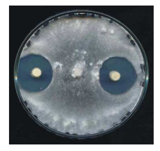
Fig. 2: Bioassay result in Agar Disk-Method of Streptomyces isolate No. 363 against Sclerotinia sclerotiorum. Center disk is S. sclerotiorum agar inoculum disk

*S: Supernatant, *P: Pellet, +: Soluble, -: Insoluble