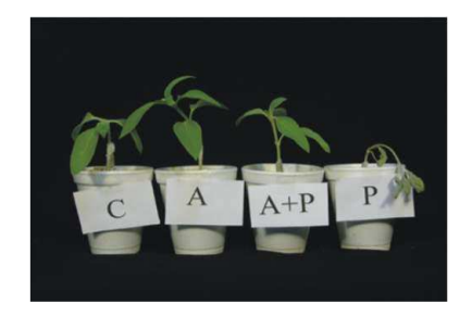
Fig. 4: In vivo greenhouse results in sunflower seedlings (P): In plants inoculated with the pathogen alone and (A+P): Plants inoculated with both pathogen and the antagonist Streptomyces isolate 363, (A): Plants inoculated with Streptomyces isolate 363 alone and (C): Untreated control plants