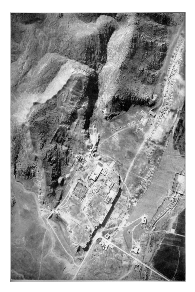
Fig. 2: Satellite image form Kariz in Kerman: Karizs Converging on the City of Kirman. Built during the course of many centuries, large numbers of Karizs converge on most Iranian Plateau cities. Some of these old Kariz tunnels cross back and forth between channels, others are twin Karizs one or both of which may be active and many have been abandoned

The discharge of the water of Kariz varies according to ground water characteristics, the nature of the soil and season. Those that tap a permanent aquifer usually have a constant flow throughout the year. If a Kariz does not tap a stable groundwater source or is in porous soil, its flow may be reduced to virtually nothing in summer, or in a dry year (Barshan, 2010). The flow of some Kariz may reach 1750 L a minute, but that of the majority of Kariz systems are much smaller, dropping to approximately 15 L a minute (Agricultural Committee of Jihad Sazandegi of Kerman, 2009).