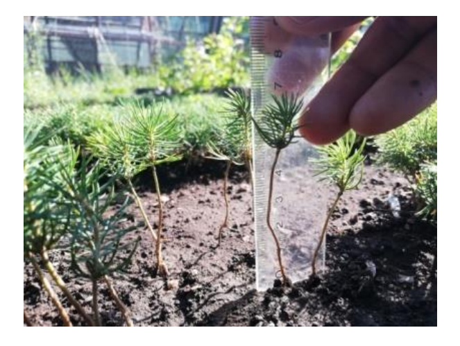
Fig. 3: Annual seedlings with the application of phytobacirin