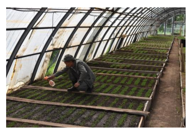
Fig. 5. Spraying with Deltaspray during the growing season