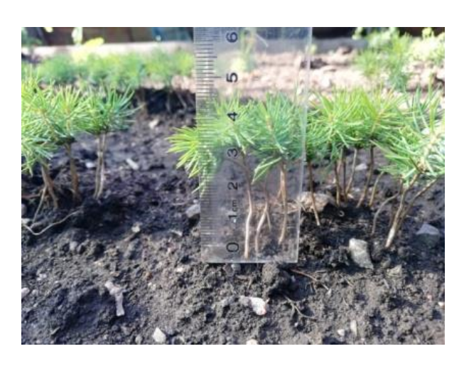
Fig. 2: Annual seedlings with the application of Gumi-K

Based on the results obtained in the summer and the autumn, the main biometric growth indicators of the seedlings of Schrenk's spruce were calculated (Tables 2 and 3).