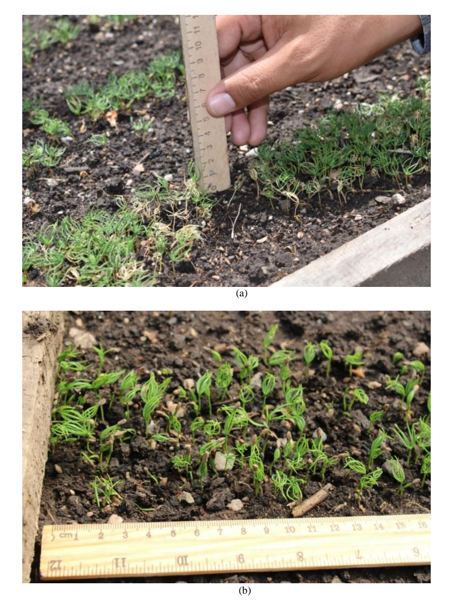
Fig. 1: The observation and measurement (a, b) of the growth of Schrenk's spruce seedlings

Based on summer and autumn results, the main biometric indicators of spruce seedlings growth were calculated. Mathematical processing of the data was carried out by the methods of analysis of variance according to (Dospekhov, 1985). The graphs were plotted according to the method of (Ananeva, 2013) using Microsoft Office Excel 2010 and Open Office Calc (version 3.4.1).