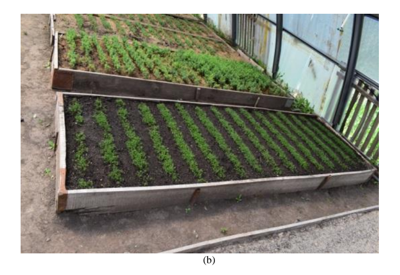
Fig. 4: General view (a, b) of annual spruce seedlings in a closed soil