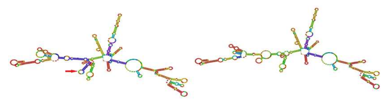
Fig. 2. To the left: The secondary structure of IL-5 mRNA, to the right: The structure of the same molecule with the variation rs1800474. Arrow indicates the site of the stem loop