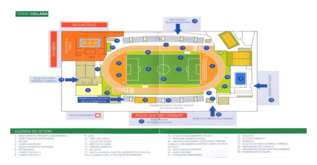
Fig. 1: Old architectural design

The sample is a random of 100 customers, to whom is submitted the questionnaire. It is made by several questions, including the choice for new and old architectural facilities, associated at request of multisport or single sport demand. The old architectural design (Fig. 1) projected 60 years ago and mirrored the demand of sport service of that age. The new architectural design (Fig. 2) instead mirrored the actual orientation on demand of sport service from a previous pilot study.