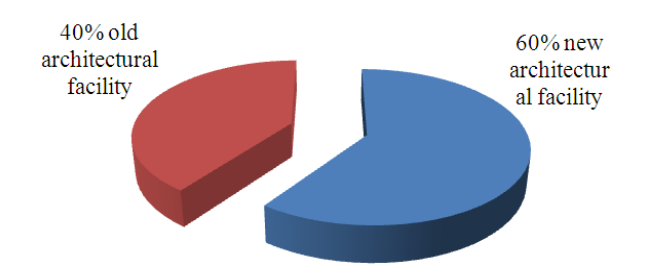
Fig. 3: Graphic architectural choice