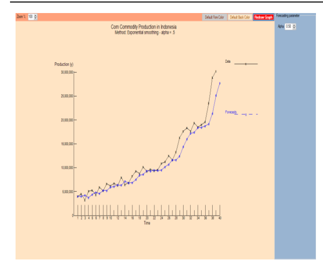
Fig. 4: Forecasting graph with the single exponential smoothing method on corn commodity production