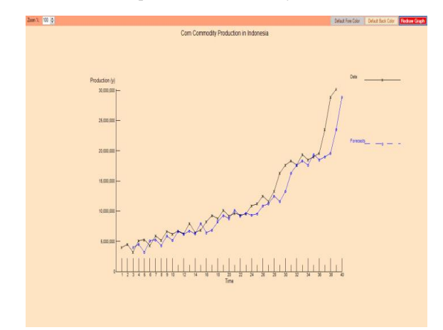
Fig. 3: Forecasting graph with the weighted moving average method at corn commodity production