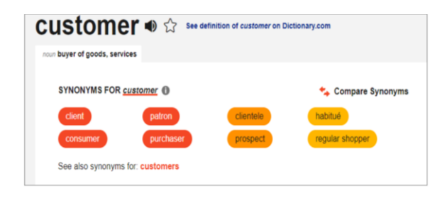
Fig. 3: The synonyms of customer concept using the thesaurus.com technique