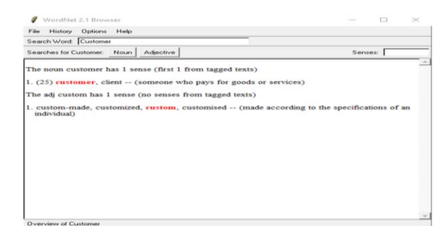
Fig. 2: The synonyms of customer concept using the WordNet2 technique

marketing the product. Social media includes TV, Fakebook, Snapshot, Instagram, and YouTube, as shown in Fig. 4.