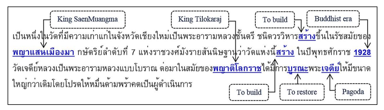
Fig. 2: An example of the temple documents

|...| วรวิหาร | <u>สร้าง</u> | ใน | รัชสมัย | ของ | <u>พญาแสนเมืองมา</u> | กษัตริย์ | ลำดับ | ที่ | 7 | แห่ง | ราชวงศ์ | มังราย | สันนิษฐาน | ว่า | วัด | แห่ง | นี้ | <u>สร้าง</u> | ใน | ปี | พุทธศักราช | <u>1928</u> | วัดเจดีย์หลวง | เป็น | พระอารามหลวง | แบบ | โบราณ | ต่อ | มา | ใน | สมัย | ของ | <u>พญาติโลกราช</u> | ได้ | มี | การ | <u>บูรณะ</u> | พระ | <u>เจดีย</u>์ | ให้ | มี | ขนาด | ใหญ่ | กว่า | เดิม | โดย | โปรด | ให้ | หมื่น | ด้าม | พร้าคต | เป็น | ผู้ | ดำเนิน | การ |