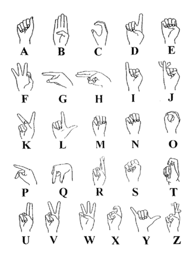
Fig. 4. Examples of finger alphabet (Charater/Numeric)

Research objects with SIBI such as: The Indonesian Sign Language for the Deaf Computer Application developed by Yanuardi et al. (2010) and Asriani and Susilawati (2010) used the Backpropagation Neural Networks (BNN) method for the Indonesian Sign Language (ISL) recognition, Sekar (2001) used the Neural Networks (NN) method for the Indonesian Sign Language (ISL), Iqbal et al. (2011) used DTW for the Indonesian Sign Language based-sensor accelerometer and sensor flex.