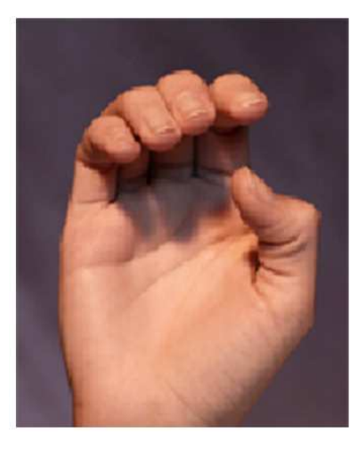
Fig. 6. Examples of the data vision

Brashear et al. (2003) used a camera mounted above the signer, so the images captured by this camera clearly solve the overlapping between the signer's hands and head. However, unfortunately, face and body gestures are lost this way.