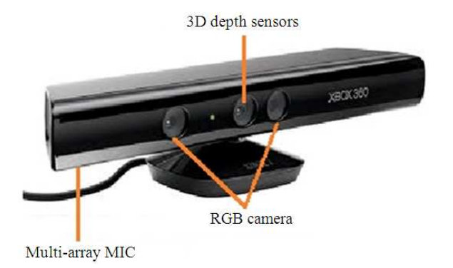
Fig. 7. Kinect device

Framework for recognition using a kinect created by Lang et al. (2011) called the Dragonfly movement-Draw on the fly and mainly consists of two classes that can be used within the assimilation of users with their software. The depth of the camera serves as an interface for OpenNI, i.e., it updates the camera image and report data of the skeleton joints of the body and the final data set for recognition process.