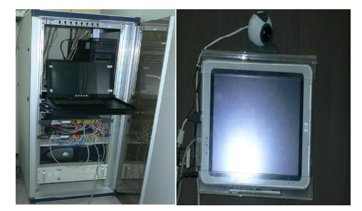
Fig. 2: U-service finder: A demo

management server is responsible for synchronizing the configuration state of service gateways with the configuration data stored in the database. The management server also provides support for storing and accessing all persistent information from gateways on the backend system, so OSGi<sup>[7]</sup> frameworks can be deployed on devices without any importunate memory (disk, flash RAM).