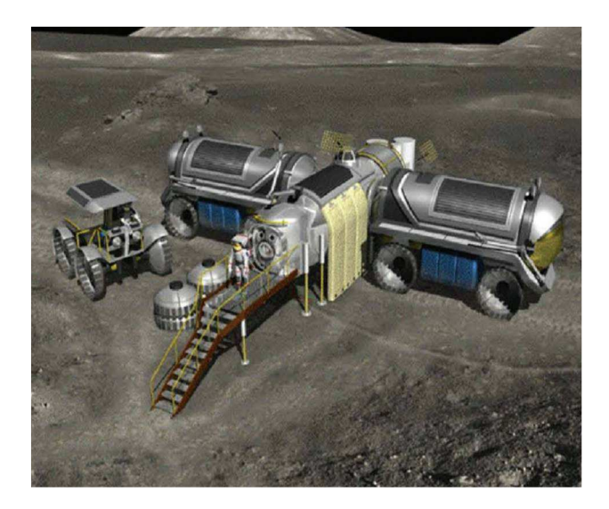
Fig. 5: Steel frame and modular structures

Nuclear fusion sometimes referred to as thermonuclear fusion, is a process where two light atomic nuclei come together to form a heavier nucleus. This reaction is at work in a natural way in the Sun and most stars of the Universe.