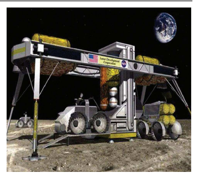
Fig. 4: Steel frame and modular structures

Because it is hard to imagine that a ship relies exclusively on solar energy, huge efforts are still being made to build a fusion-based nuclear energy source.