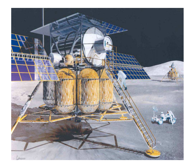
Fig. 3: First Lunar Outpost regenerative fuel cells