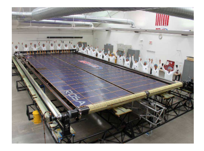
Fig. 2: UID deployed and unloaded in a thermal configuration used in a vacuum