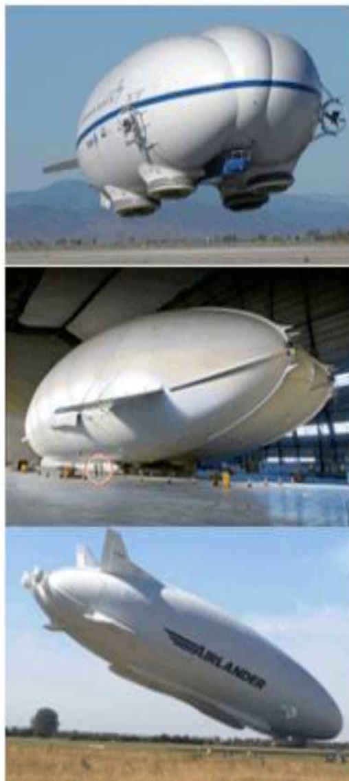
Fig. 14. Airlander 10

Such a ship does not consume energy to maintain it at a certain altitude, but only for acceleration and braking.