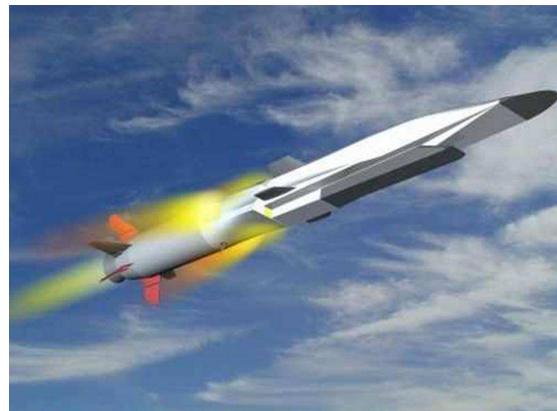
Fig. 26. The X-51A Waverider

But the new X-51A Waverider will cross the Atlantic in less than an hour. The prototype is developed by Boeing and can reach the speed of 6 mach, that is over 6,400 km per hour.