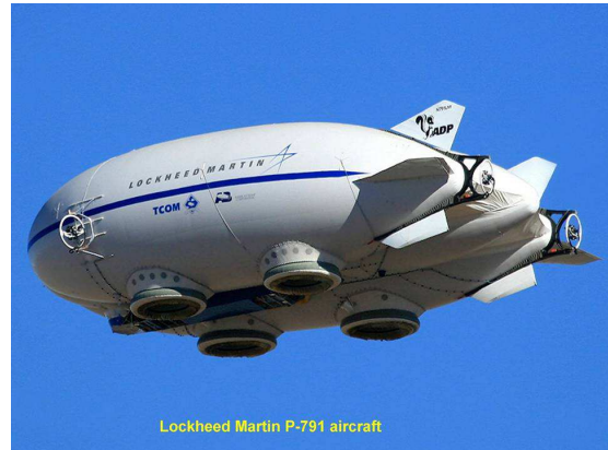
Fig. 8. Lockheed martin P-791 aircraft.

Serious work from Micro began in 1970, the prototype building began seriously at the end of the year. While the BD-4 was quite conventional, Micro was a radical design. It is a very small, single-sided design that looks more like a plane than a "top plan", the pilot in a semi-inclined position under a large plexiglass canopy, just a few inches above his head. Behind the cab is a 40 cc and 40 cc propeller with four 40 cc propellers that propel the propeller. Two versions, BD-5A, with lateral adjustments of 14.3 "(4.34 m) and acrobats and BD-5B with a wing of 21.6" (6.55 m) were planned. Using the glider Builders could optionally purchase both wings, changing them in about 10 min (Fig. 11).