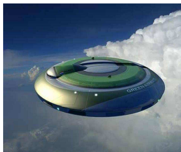
Fig. 25. Green airways flying saucer