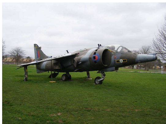
Fig. 1. The Hawker Siddeley Harrier; this is an RAF Harrier GR.3.

The stealth, supersonic and multi-erotic fuel has been called the F-35 Lightning II in July 2006. The JSF is built in three variants: a US Air Force take-off and landing; a shipping Variant (CV) for the US Navy; and a Short Take-Off and Landing aircraft (STOVL) for US Maritime Corps and Royal Navy Fig. 2.