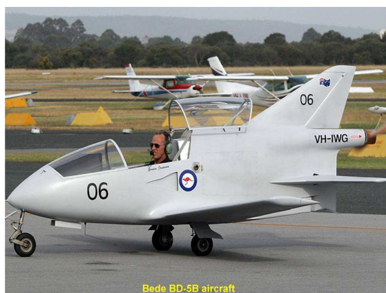
Fig. 11. Bede BD-5B aircraft

Besides being easy to fly, the BD-5 was designed to be easy to build and own. The fuselage was built mainly from glass fiber panels on an aluminum frame, reducing construction time to just a few hundred h. Although the first projects required welding in the landing area, planning was eliminated in kit versions, so the construction would not require special tools or abilities. Even the operating cost would be extremely low, ensuring fuel efficiency of nearly 40 mpg. With open wings, the airplane could be wrapped in a small custom trailer, allowing it to be towed with a car to be stored in a garage and then into any pay area suitable for take-off.