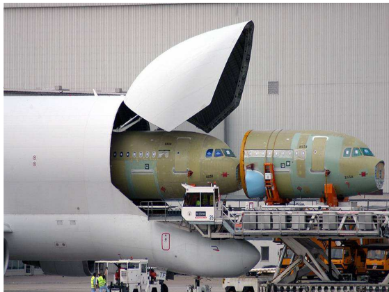
Fig. 10. Airbus A300B4-608ST Super Transporter aircraft