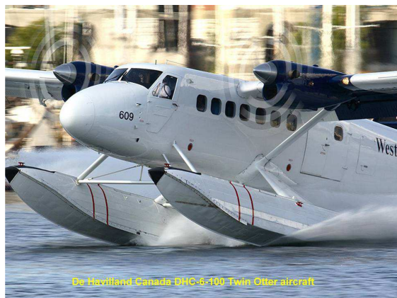
Fig. 6. De Havilland Canada DHC-6-100 Twin Otter aircraft.

The Edgley EA-7 Optics Fig. 7 was a lightweight British observation aircraft, designed as a cheap helicopter alternative, which initially sold $200,000. The Optics, designed by John Edgley and built by Brooklands Aerospace, had an unusual configuration with a cab in front of the three-door windows, reminiscent of an Alouette helicopter. Behind it was a six-stroke engine running on a duct fan, a double arm with a double arm and a single high lift. The tricycle's fixed chassis had a step to the left. The wings were unsuccessful and unplanned and the aircraft had a fairly standard metallic structure with stressed aluminum. The distinctive appearance of the aircraft has led to the fact that it was known as "bug-eye" in some popular reports.