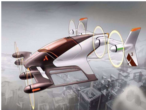
Fig. 23. Airbus develops the first flying vehicle, Source: http://www.cars.ro/inedit/airbus-primul-vehicul-zburator-12172.html