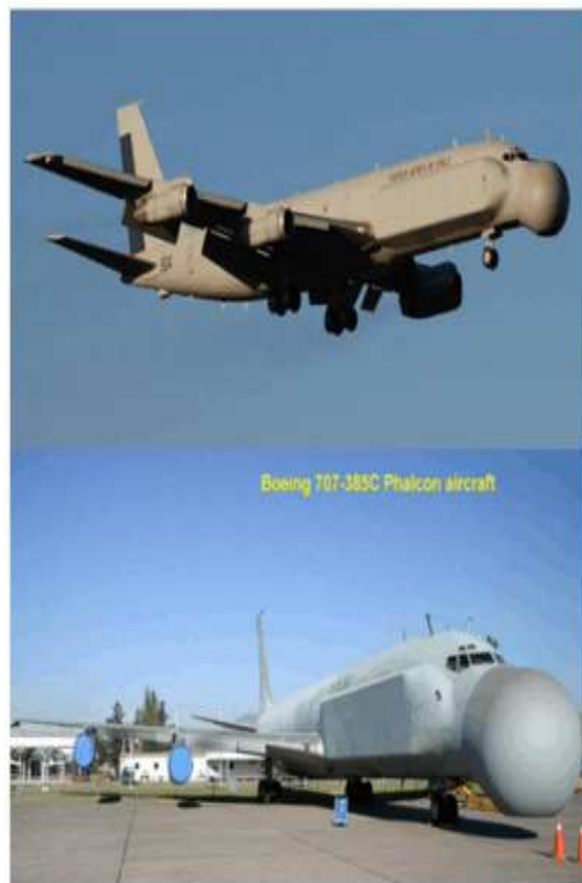
Fig. 12. Boeing 707-385C Phalcon aircraft

The fuel ignited when it came into contact with the hot components of the turbojet engine, forcing the pilot to change altitude, climb and save.