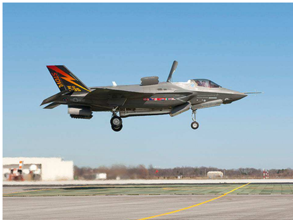
Fig. 2. The F-35B Short Takeoff and Vertical Landing (STOVL) variant for the US Marine Corps and the Royal Navy.