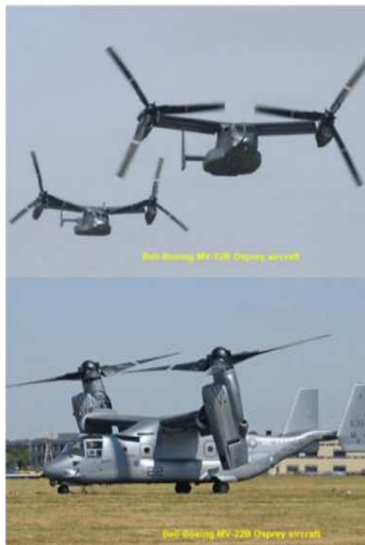
Fig. 4. The bell-boeing MV-22B osprey, (M from Marine).

The Bell Helicopter team and the Boeing helicopters received a development contract in 1983 for pre-powered aircraft. Thus the Bell Boeing team jointly produced the aircraft.