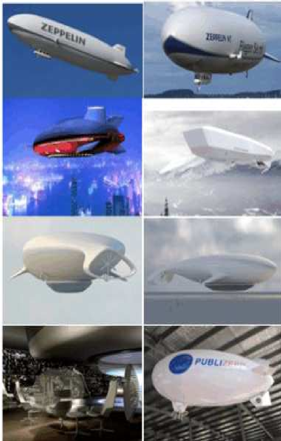
Fig. 22. Some modern Zeppelins

These vessels are semi-rigid and not strictly zeppelins, because their shape is partly based on internal pressure, partly on a frame.