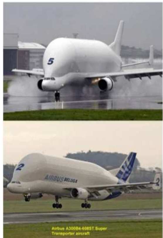
Fig. 9. Airbus A300B4-608ST super transporter aircraft.

For improved performance, the aircraft featured both a V-tail and a retractable landing gear to reduce power. The calculated drag was so small that the spoilers were added to the wing to improve the landing deceleration. This was apparently the first application of spoilers on a light aircraft. Low draw has implied excellent performance; with short wings, it would reach 340 km/h on the cruise, while the long-term BD-5B would be slightly slower and will have an extended range of 1,215 miles.