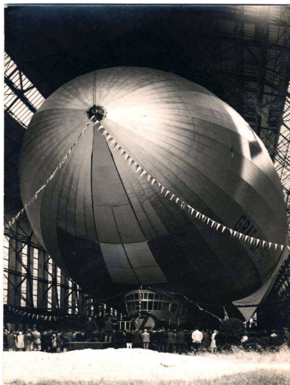
Fig. 20. First zeppelin

The Zeppelin patrols had priority over any other aircraft activity. Most of the ships manufactured were commissioned by Marina. During the war, nearly 1,000 patrols were made only in the North Sea, compared with about 50 strategic bomb attacks. The German Navy had 15 zeppelins in 1915 and could have two or more patrols at any time, almost regardless of weather. They prevented British ships from approaching Germany, saw when and where the British put a mine and then helped them destroy them. Zeppelins could sometimes land at sea near a minesweeper, bring on board an officer and show him the locations of the mines. Prior to the high availability of incendiary munitions, commercial operations were too risky, they would also be landed or thrown near a counterfeit commercial ship so that all ships would go to boats, then inspect the ship and destroy it a prize.