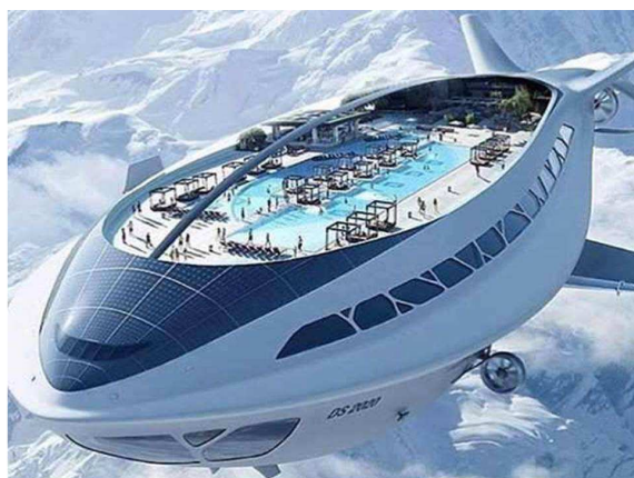
Fig. 16. The passenger's cabin above the ship can be developed to create enhanced comfort conditions, with swimming pools, gardens, bars, sports grounds