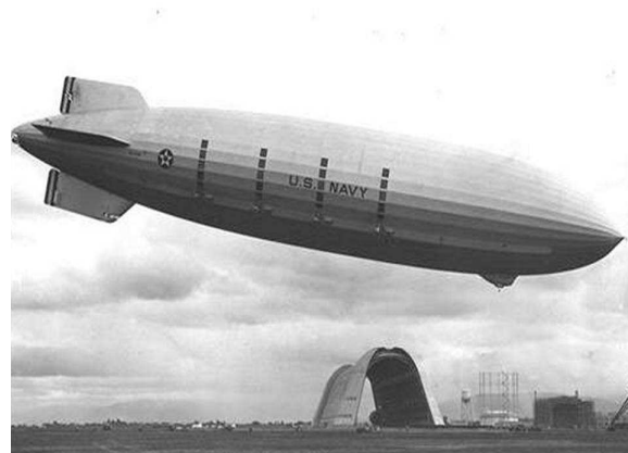
Fig. 21. U.S. navy zeppelin ZRS-5 "USS Macon" over Moffett field in 1933

In May a fire broke out in the Zeppelin building, which destroyed most of the remaining parts. The rest of the pieces and materials were soon dismantled, almost there is no trace of the German "giants of the air" left by the end of the year.