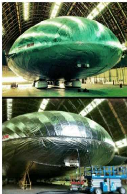
Fig. 18. A new type of airship, Aeroscraft, funded by the US Army, is ready for the first test.

The major advantage is that, thanks to the innovative system, Aeroscraft does not need a terrestrial infrastructure but just enough space to land.