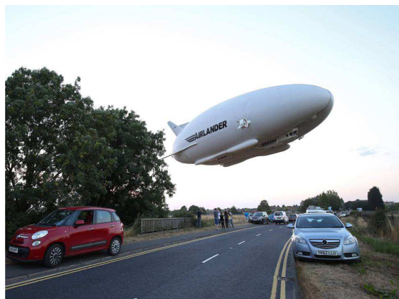
Fig. 15. The ship has a good maneuverability regardless of altitude and can keep on flying at any height