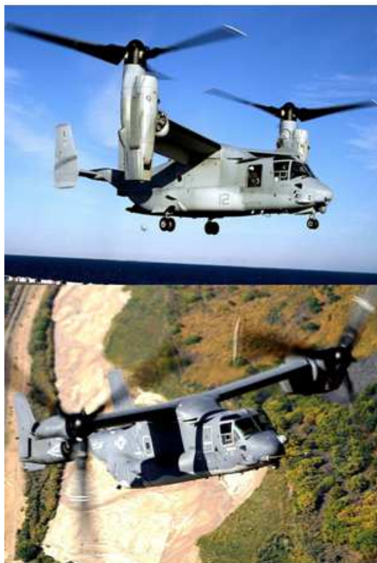
Fig. 3. The bell-boeing V-22 Osprey.

The V-22 name comes from Vertical Communications Vertical Communications Vertical (JVX) and began in 1981.