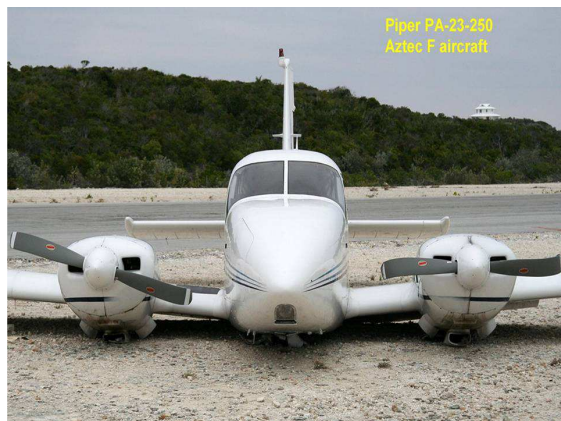
Fig. 5. The piper PA-23-250 Aztec F aircraft.

In 1958, an improved version of the Lycoming O-540 engine of 250 hp (186 kW) and the addition of a vertical tail was produced as PA-23-250 and was named Aztec.