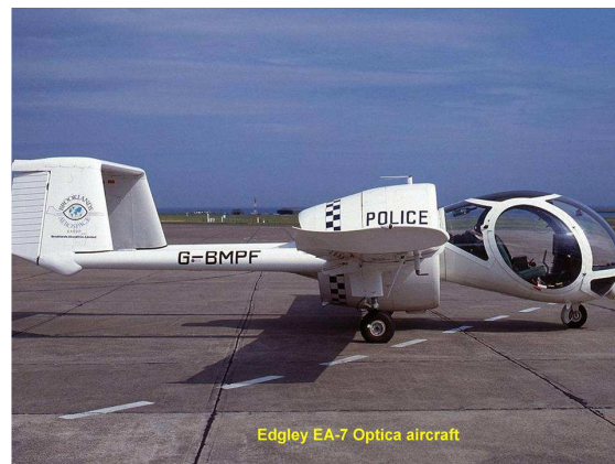
Fig. 7. Edgley EA-7 Optica aircraft.

The first aircraft was launched on December 14, 1979, powered by a Lycoming O-320 engine of 150 hp (112 kW) and piloted by the Cranfield Aeronautical College pilot. Optics, powered by a stronger engine, Lycoming O-540, entered production in 1983, gaining certification on February 8, 1985. A police accident of Opty G-KATY on May 15, 1985 killed two members of the Hampshire Constabulary. The cause was suspected to be a stall: insufficient air speed during a comeback causing instability. The reason for slow speed has never been established. This led to Edgley's bankruptcy when Optica Industries was set up in October 1985 to continue production and 25 were built before a fire-induced fire destroys the plant and anything other than the flying optics. The company was reformed again as Brooklands Aircraft and Optica returned to production, production stopped in March 1990 when Brooklands Aircraft went bankrupt. The design of the optics was bought again by John Edgley (along with the FLS Sprint 160 design). Edgley hopes to put both types into production and the 300/021 G-BOPO series is restored as a British protester (Petrescu, 2009; Petrescu and Petrescu, 2011; 2012; 2013a; 2013b; 2013c).