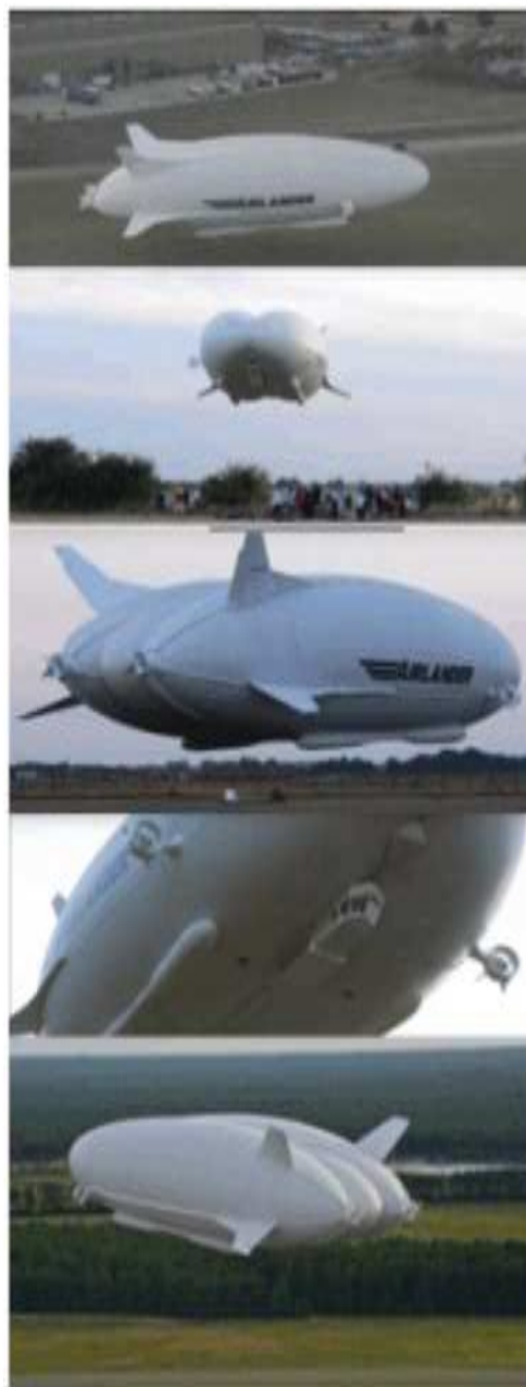
Fig. 13. The world's largest airplane, Airlander 10

Unlike a normal ship, Airlander does not have a fixed internal structure, but it becomes rigid when filling with helium.