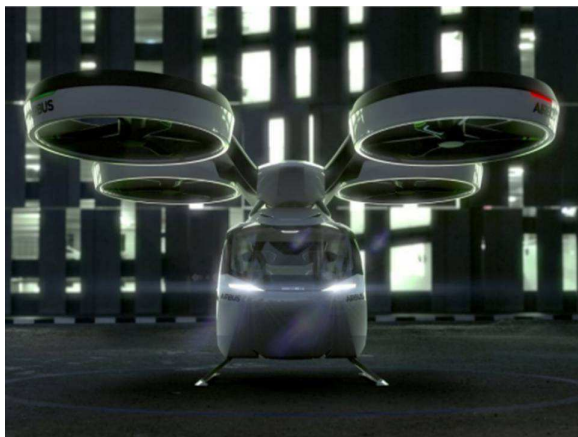
Fig. 24. Airbus has joined forces with Italdesign to develop the Pop.Up concept. Source: Airbus has joined forces with Italdesign to develop the Pop.Up concept