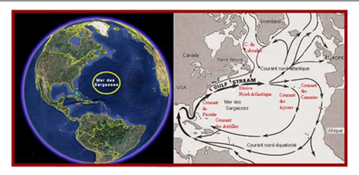
Fig. 2. http://wwz.ifremer.fr/guyane/content/download/41806/569470/file/Sargasses%20Guyane.pdf