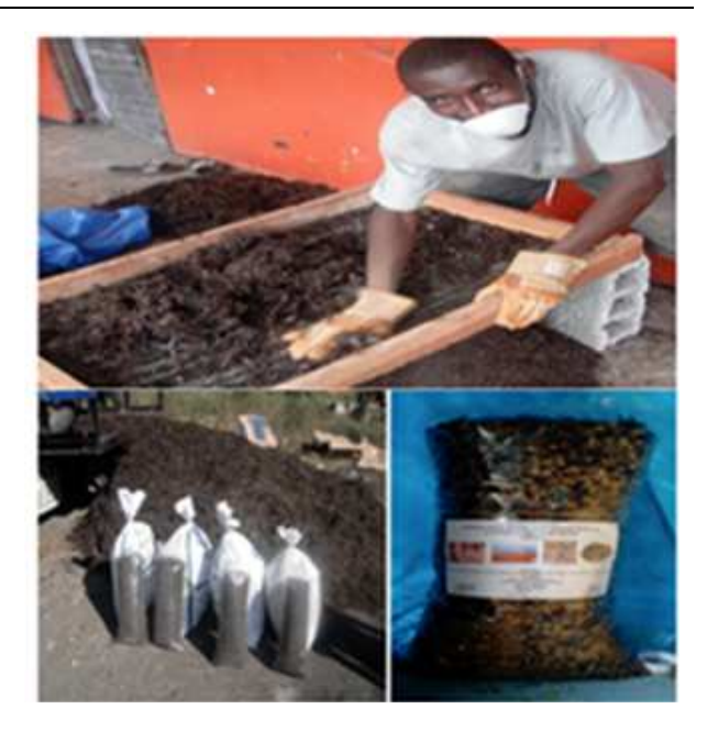
Fig. 4. Production of organic fertilizer from Sargassum (By Georges Valme, Leogane Haiti)

Algae extracts and algae have been shown to: