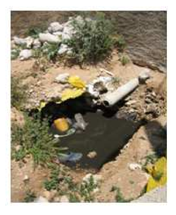
Fig. 8: Lost well used in Dayet Ifrah

The present research on ecosan in Dayet Ifrah consequently met the approval of the population majority and it was necessary to define clear strategies to identify people who could receive the experimental UDDT.