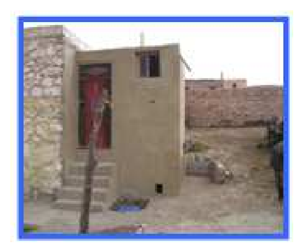
Fig. 6: UDDT built in June 2009

This publication highlights the ecosan promotion strategies and policies for its adoption by the future ecosan users in Morocco. It seeks: