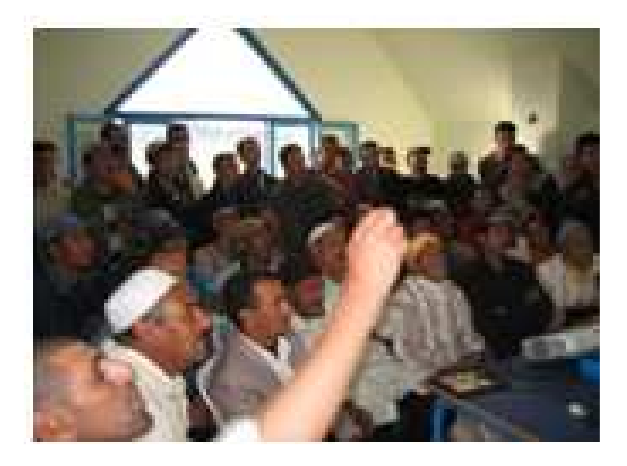
Fig. 9: Meetings of sensitizing of the population

Meetings of recommendation and decision making: In this rural area and at the beneficiary households, there were obvious relationships between UDDT adoption and the agricultural factors and attitudes towards wastewater treatment. They are rural families that defecate in nature. They are thus convinced of association between the property of the UDDT as a technique of collecting and treating wastewater and the conviction to re-use the human excrement (faeces and urine) in agriculture, which would allow on the one hand to protect public health and, on the other, to provide hygienically healthy products for agriculture. For these reasons, the adoption and the promotion of an ecological sanitation in the rural world, where the requirement of fertilizing is strongly expressed, are very welcomed.