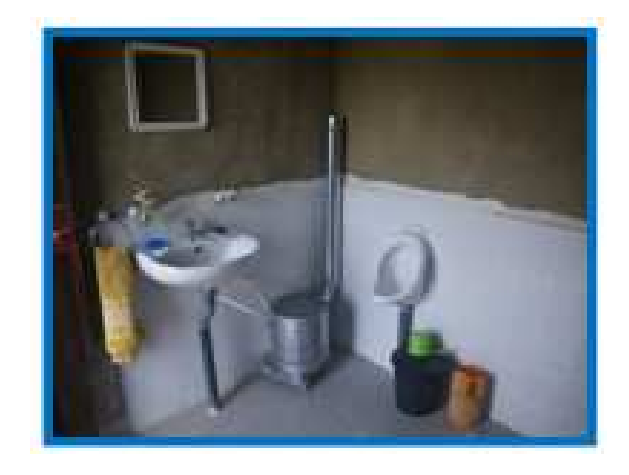
Fig. 3: Wash-hand basin and urinoire

It is composed of two pits functioning alternatively (Fig. 2); a wash-hand basin as well as an urinoire and shower (Fig. 3).