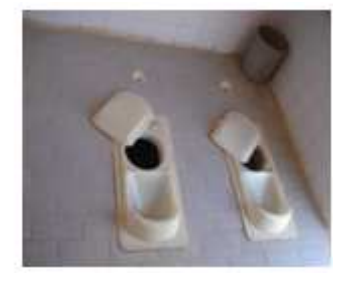
Fig. 2: Two pits functioning alternatively