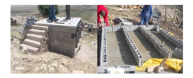
Fig. 1: 1st UDDT in Morocco built in December 2009