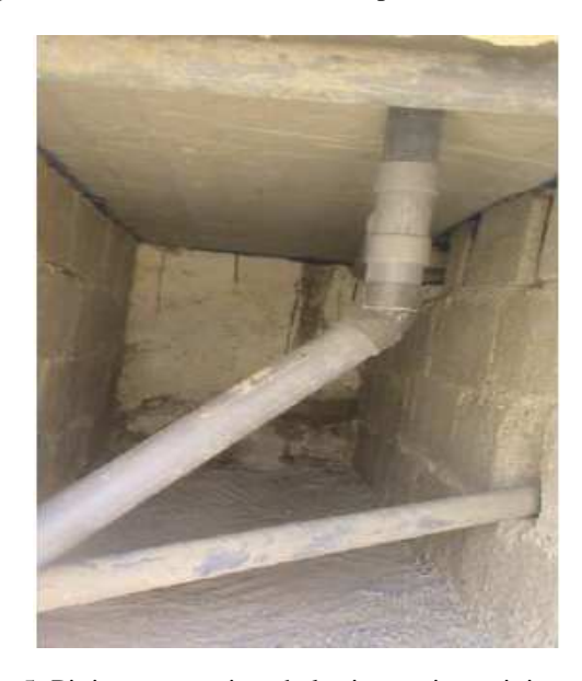
Fig. 5: Pit in construction sheltering various pipings

The fresh excrement will be covered with a mixture of ash as a better additive at destruction of Escherichia coli and Enterococcus spp (Niwagaba et al. , 2009). When the pit is full after approximately a year of use, it will be covered by the wooden lid in order that its contents mineralize.