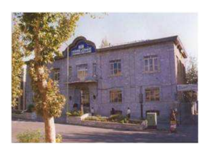
Fig. 5: Municipality of the city

A group of canalizations were done in the "Sardnoy" Plains (the present military base) on the west of Sanandaj for the Court of Justice.