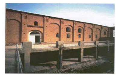
Fig. 3: Church of Sanandaj