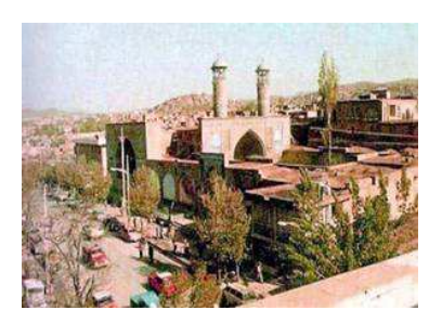
Fig. 4: Jami Mosque