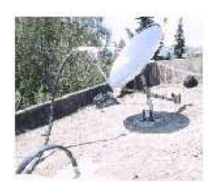
Fig. 1: One example of the heliostats solar concentrator and light transmission through optical fibers (Kandilli et al. , 2008)

Concentrating systems use lenses or reflectors to focus sunlight onto the solar cells or solar thermal absorbers. High concentration of solar radiation requires tracking of the sun around one axis or two axes, depending on the geometry of the system. The higher the concentration, the more concentrator material per unit area of solar cell or thermal absorber area is generally needed. It is therefore more appropriate to use lenses than reflectors in highly concentrating systems, because of their lower weight and material costs.