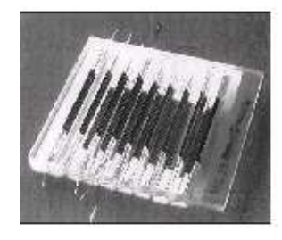
Fig. 4: Photograph of a static prism-array concentrator module (Uematsu et al. , 2001)

Fig. 3: Photograph of the polar axis tracking ridge with 8×55 Wp PV panels (Poulek and Libra, 2000)