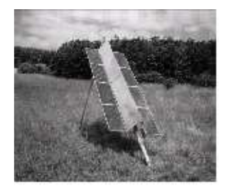
Fig. 3: Photograph of the polar axis tracking ridge with 8×55 Wp PV panels (Poulek and Libra, 2000)