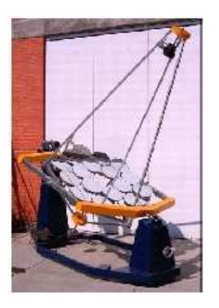
Fig. 2: DEFRAC-Spanish acronym of device for the study of highly concentrated radioactive fluxes (Estrada et al. , 2007)

De la Mora et al. (2009) reported using Porous Silicon Photonic Mirrors (PSPM) as secondary reflectors in solar concentration systems. The PSPM were fabricated with nanostructure porous silicon to reflect light from the visible range to the near-infrared region (500-2500 nm), although this range could be tuned for specific wavelength applications. The PSPM are multilayer of two alternated refractive indexes (1.5-2.0), where the condition of a quarter wavelengths in the optical path was imposed. The PSPM were exposed to high radiation in solar concentrator equipment as shown in Fig. 2. As a result, it observed a significant degradation of the mirrors at an approximated temperature of 900oC. In order to analyze the origin of the degradation of PSPM, it was modeled the samples with a non-linear optical approach and study the effect of a temperature increase. It concluded that the main phenomenon involved in the breakdown of the photonic mirrors is of thermal origin, produced by heterogeneous expansion of each layer (Mora et al., 2009).