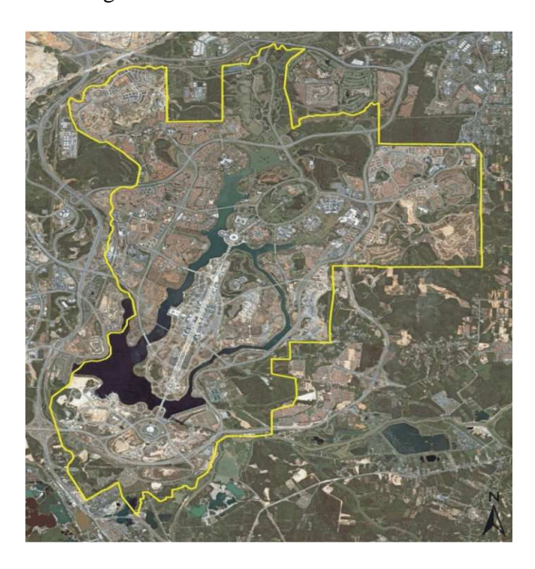
Fig. 2: Map of the IBS project site in Parcel 7, Presint 9, Putrajaya

Information and data were collected through interviews (using questionnaire) with 2-3 years of monitoring throughout the project duration, in conjunction with the developer, contractor, subcontractor, project manager, quantity surveyor and site supervisor. It should be noted that this study takes into account only on-site waste generation, composition and recycling. The study has a limitation. For the prefabricated construction project site, it did not include