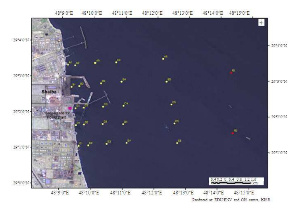
Fig. 2: Sampling stations in the Kuwait marine waters near Shuaiba Power and Desalination plant