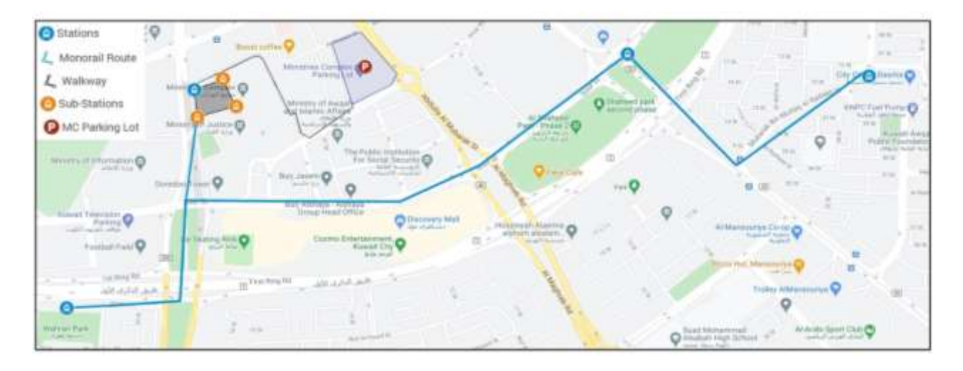
Fig. 2: Overview of the proposed monorail route and stations for the first location

The locations of stations were carefully selected to provide an efficient guide and friendly access for passengers with consideration to the rules of safety and comfortable transfer. Proposed stations are elevated and serviced by staircases and escalators. Additionally, the proposed locations provide easy connection with other modes of transportation and nearby residential, business and commercial areas and public service facilities. Figure 3 shows an overview of how the proposed station should look like.