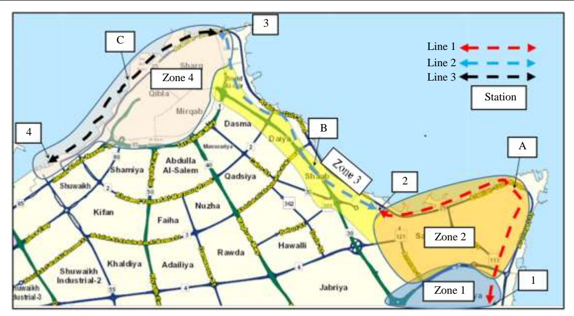
Fig. 4: Proposed monorail route and trip generation zones for Arabian gulf street

Taha Ahmed et al. / American Journal of Engineering and Applied Sciences 2021, 14 (1): 103.111 DOI: 10.3844/ajeassp.2021.103.111