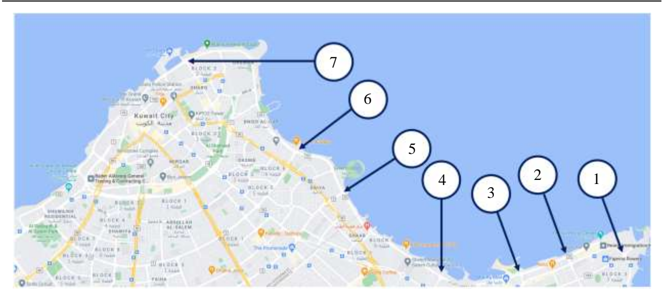
Fig. 6: Selected intersections for LOS analysis

Taha Ahmed et al. / American Journal of Engineering and Applied Sciences 2021, 14 (1): 103.111 DOI: 10.3844/ajeassp.2021.103.111