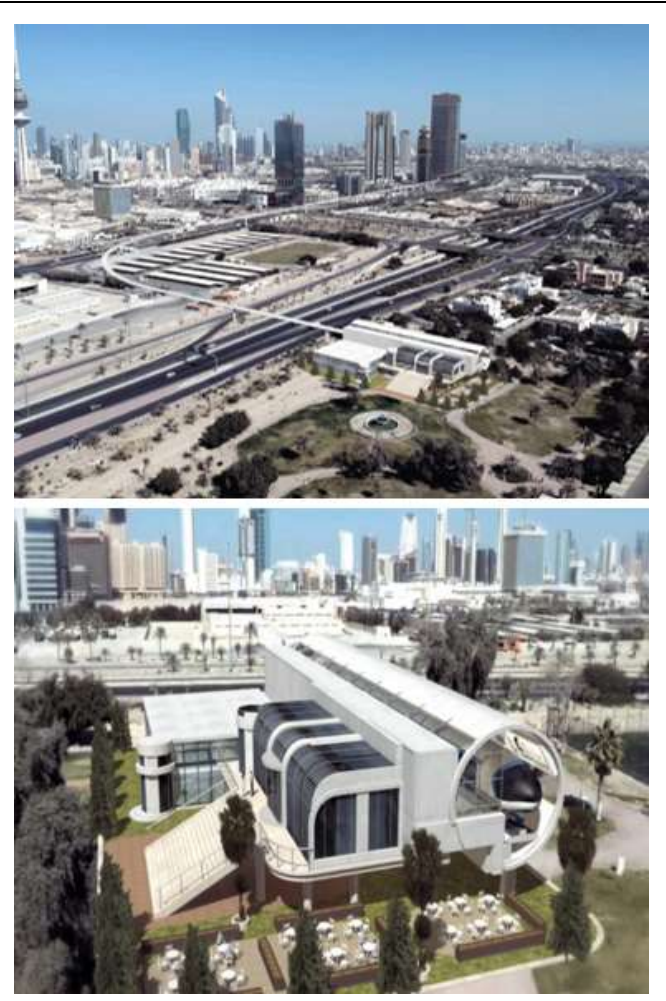
Fig. 3: Layouts of planned station location

Taha Ahmed et al. / American Journal of Engineering and Applied Sciences 2021, 14 (1): 103.111 DOI: 10.3844/ajeassp.2021.103.111