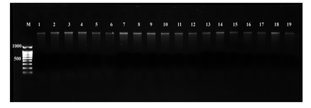
Fig. 3. Genomic DNA extraction from biopsy specimens of 19 gastric maladies patients Agarose gel (1%) electrophoresis of genomic DNA extracted from 19 gastric biopsies, lane M: For 1 kb DNA ladder marker