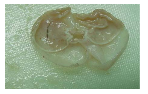
Fig. 2: Mild macroscopic injury of gastric mucosa in (500 mg kg<sup>-1</sup>) extract treated animals. Near complete inhibition of gastric lesion formation

Fig. 1: Severe macroscopic necrosis of gastric mucosa in negative control animals. Severe lesion of the corpus caused by absolute ethanol