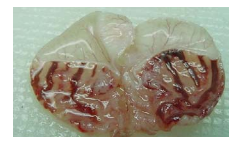
Fig. 1: Severe macroscopic necrosis of gastric mucosa in negative control animals. Severe lesion of the corpus caused by absolute ethanol

Gross examination: The present study demonstrated that oral administration with the extract (250 or 500 mg kg<sup>-1</sup>) significantly prevented the formation of gastric mucosal ulcers and reduced ulcer formation in a dose dependent manner compared to animals administered with only distilled water (Table 1, Fig. 1 and 2). The present study also showed that the oral feeding of rats with 20 mg kg<sup>-1</sup> omperazole or 500 mg kg<sup>-1</sup> extract resulted in higher protection for the gastric mucosa compared to rats administered with only 250 mg kg<sup>-1</sup> of extract (Table 1). There were no significant differences between the cytoprotective abilities of the animals treated with 20 mg kg<sup>-1</sup> omegrazole compared to the animals treated with 500 mg kg<sup>-1</sup> extract.